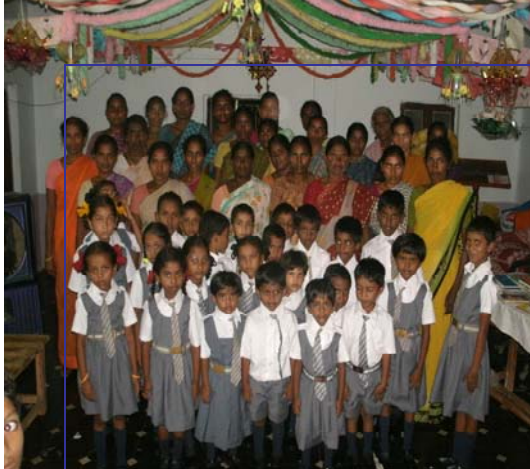
SDA School -Manikonda, Krishna Dist