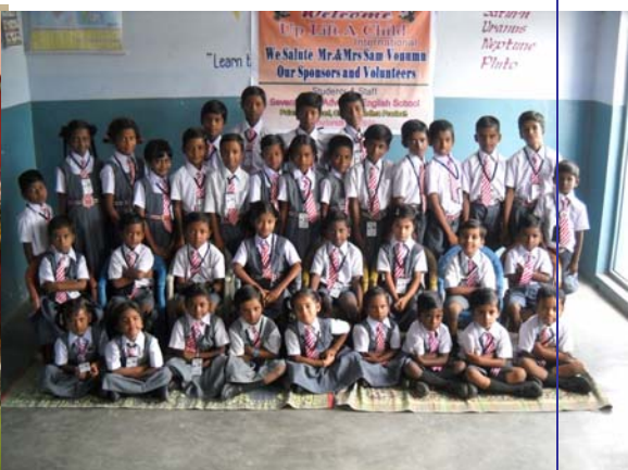
SDA School, Chittoor, AP