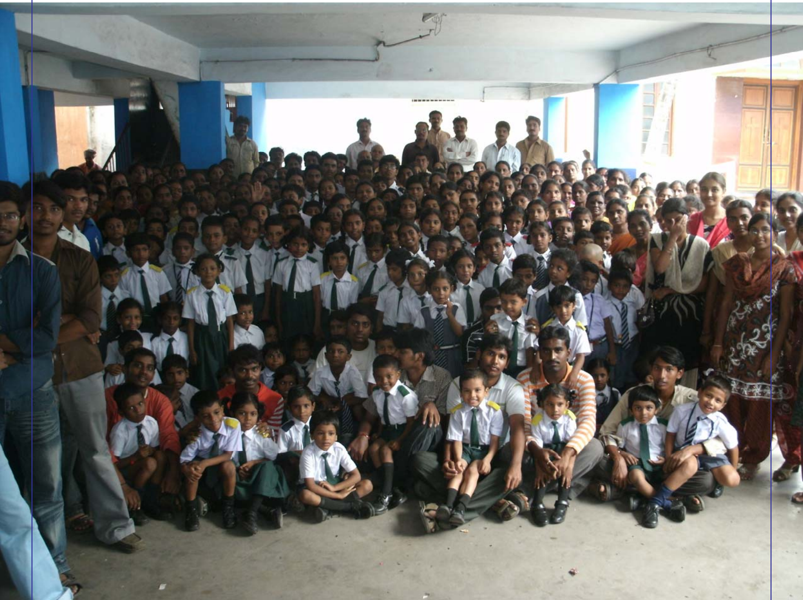
Olivet Public School – Visakhapatnam, AP, India (we have around 100 children in this school)