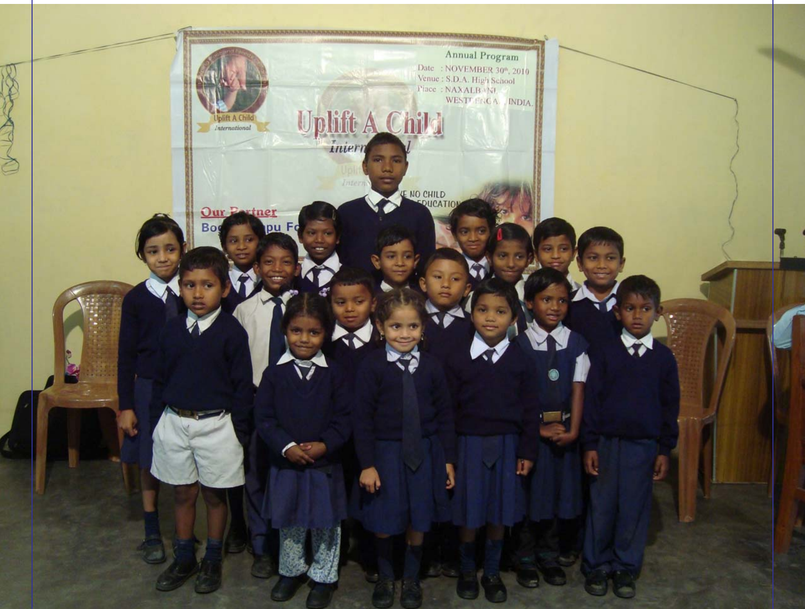
Our Children at Naxalbari, West Bengal, India