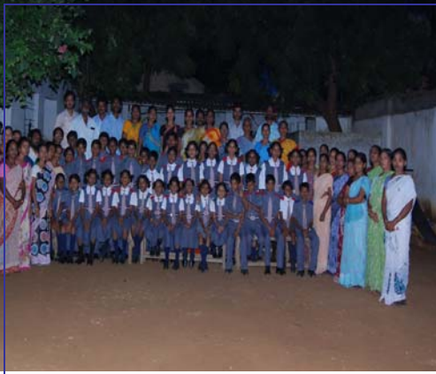
Vizag – Trinity School