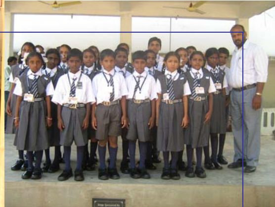
Kesanapalle, E.G Dist, AP