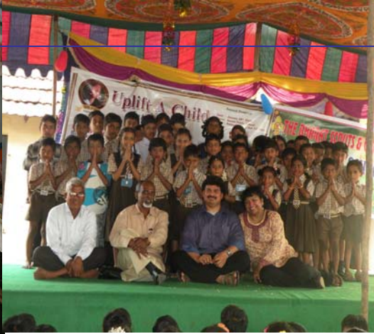
Swathi School - Pedalanka, Guntur Dist