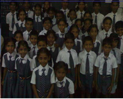
Vizag – SDA School