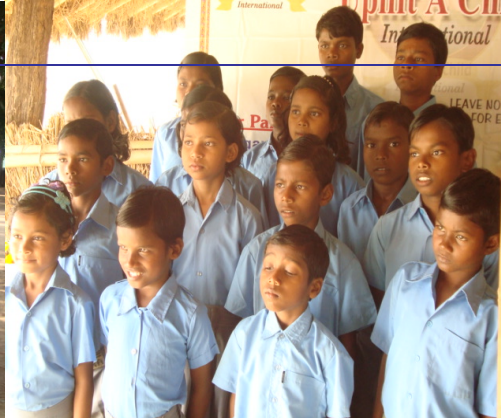
Children at Karmatar, Jharkhand