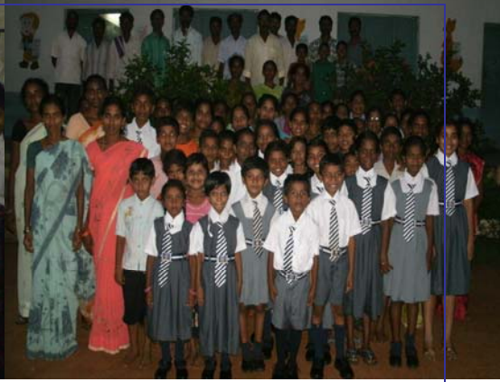
Vizag – MVP SDA School