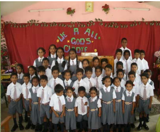
SDA School – Bobbili, Vizianagram Dist