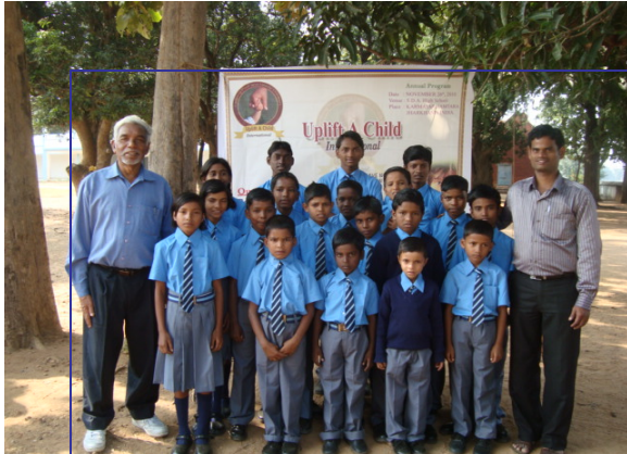
Children at Bisunpur – Jharkhand