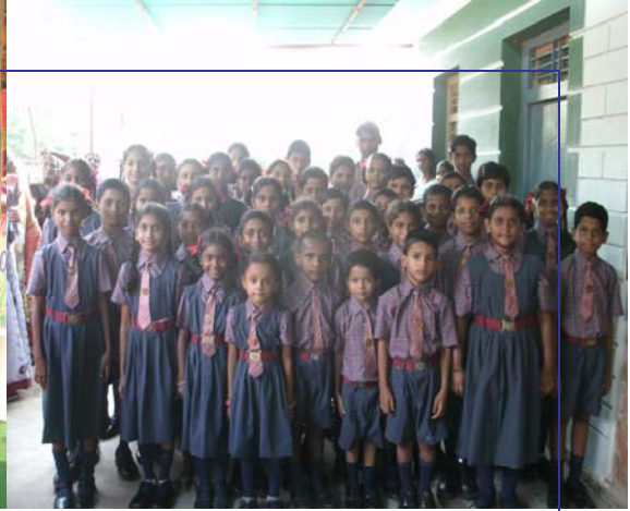
Apollo School, Tuni, E.G. Dist