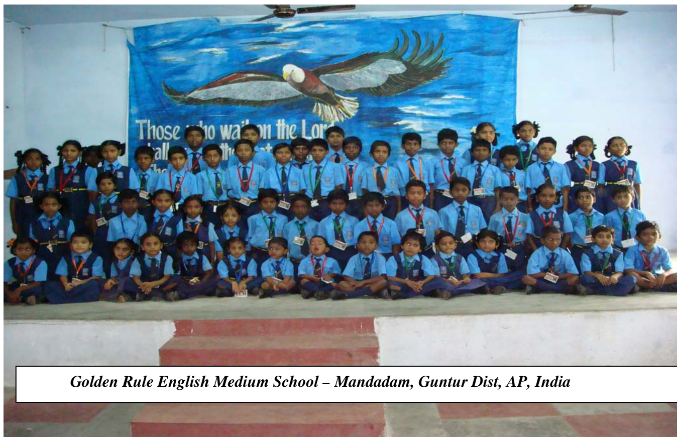
Golden Rule English Medium School – Mandadam, Guntur Dist, AP, India