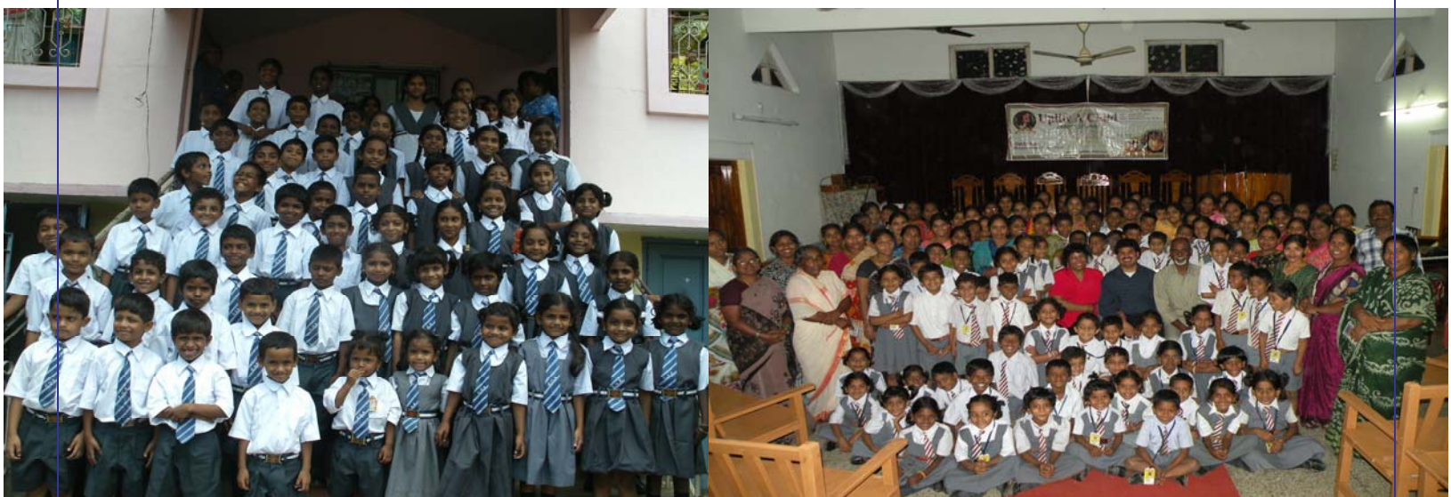
Our Children in Rajahmundry – SDA High School, E.G. Dist, AP, India