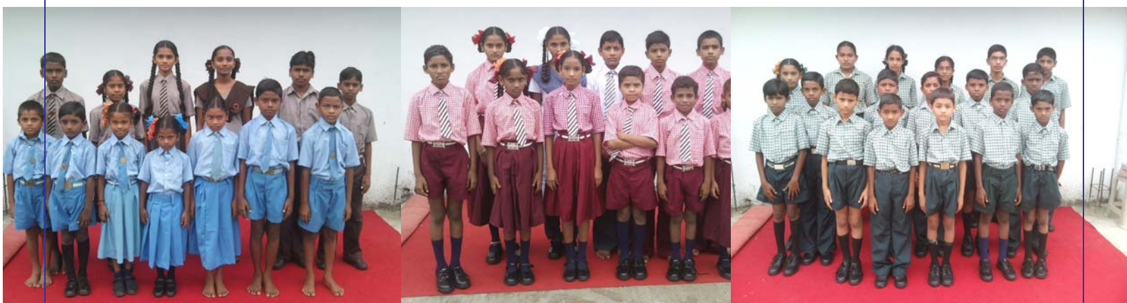
Our Children in Nizamapatnam – Pragathi School, Vikas School & Al Quamar School , Guntur Dist, AP