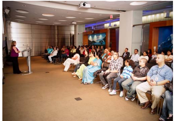
Uplift a Child – Maryland, 17 th April 2010

As of December 2010, we have 285 sponsors from 9 countries. Most of our sponsors are not rich. 99% of them belong to middle class families with a hand to mouth income. We are very privileged to have them on our team. They have come out of their way to make a difference in these children's lives through their gift of education.