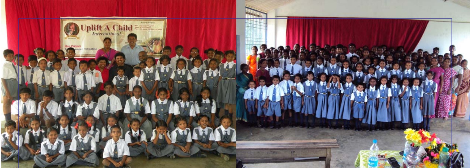
Our Children in Pitapuram – SDA High School, E.G. Dist, AP, India