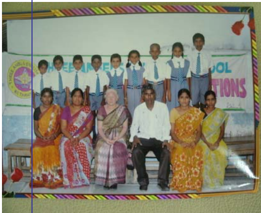
3 Angels School – Bethavole, Nalgonda