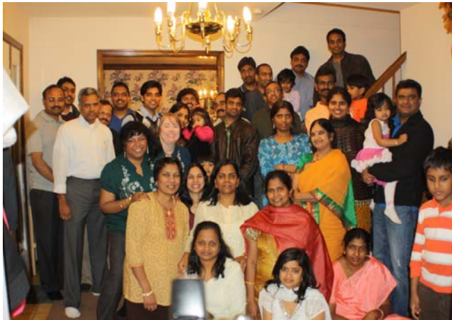
Uplift a Child – New Jersey, 27 th March 2010

Detailed Report available @ http://upliftachild.org/reports/2010SponsorsMeetings.pdf