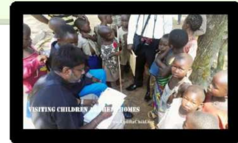
2020 UpliftaChild.org CONGO