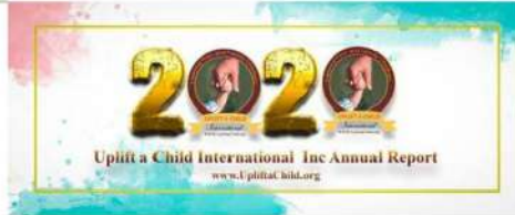
2020 UpliftaChild.org Annual Video