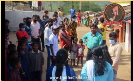
Karaput, Odissa | India