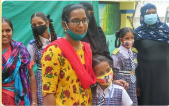
House Visiting | Hyderabad, India